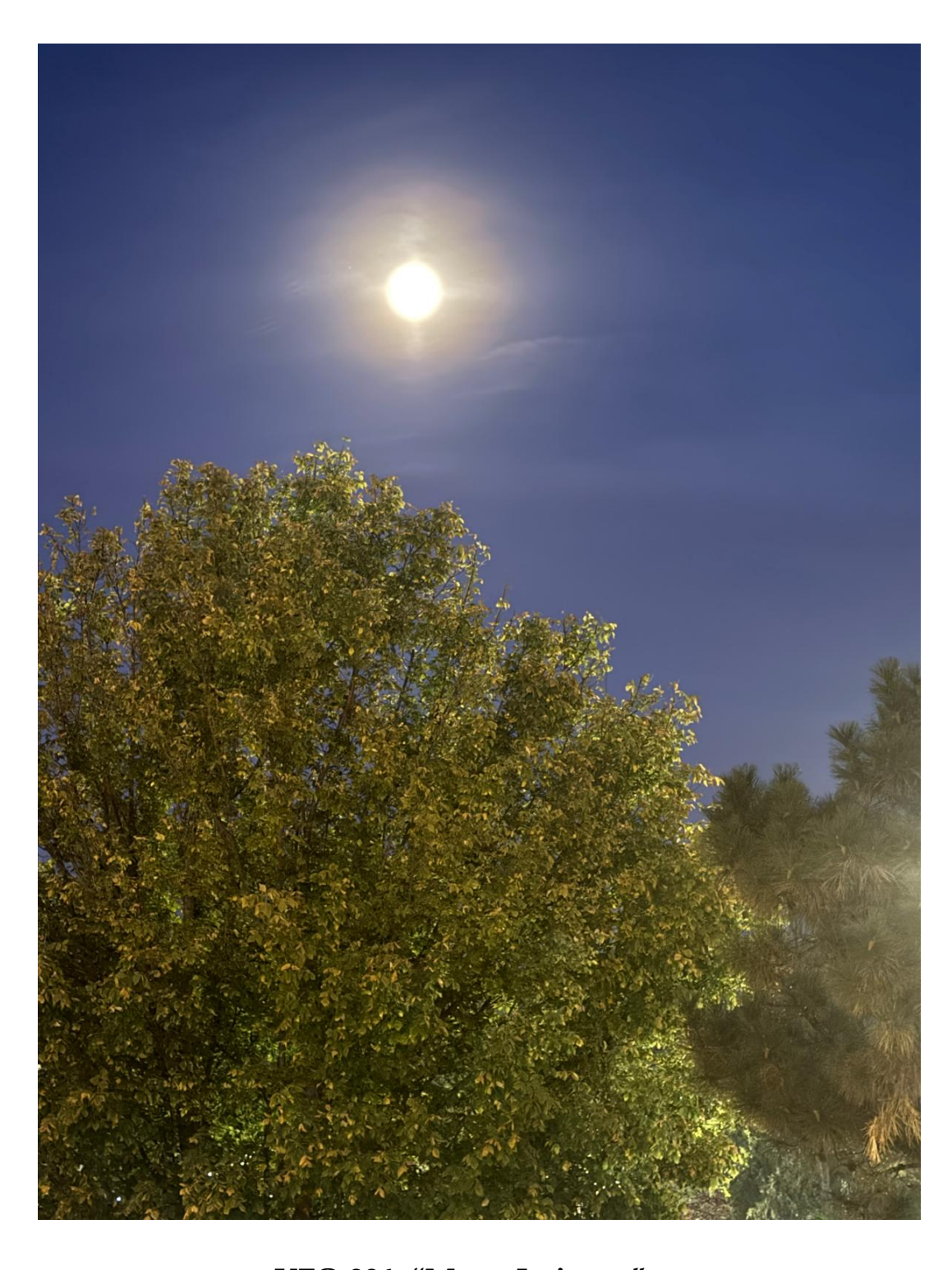
UFO 004: "Moon Imitator"

14 October 2024 (18:41, GMT+03). Centrum, Kirikkale. Captured with an iPhone. Note the exceptional brightness at a time when neither the sun nor the moon was visible.