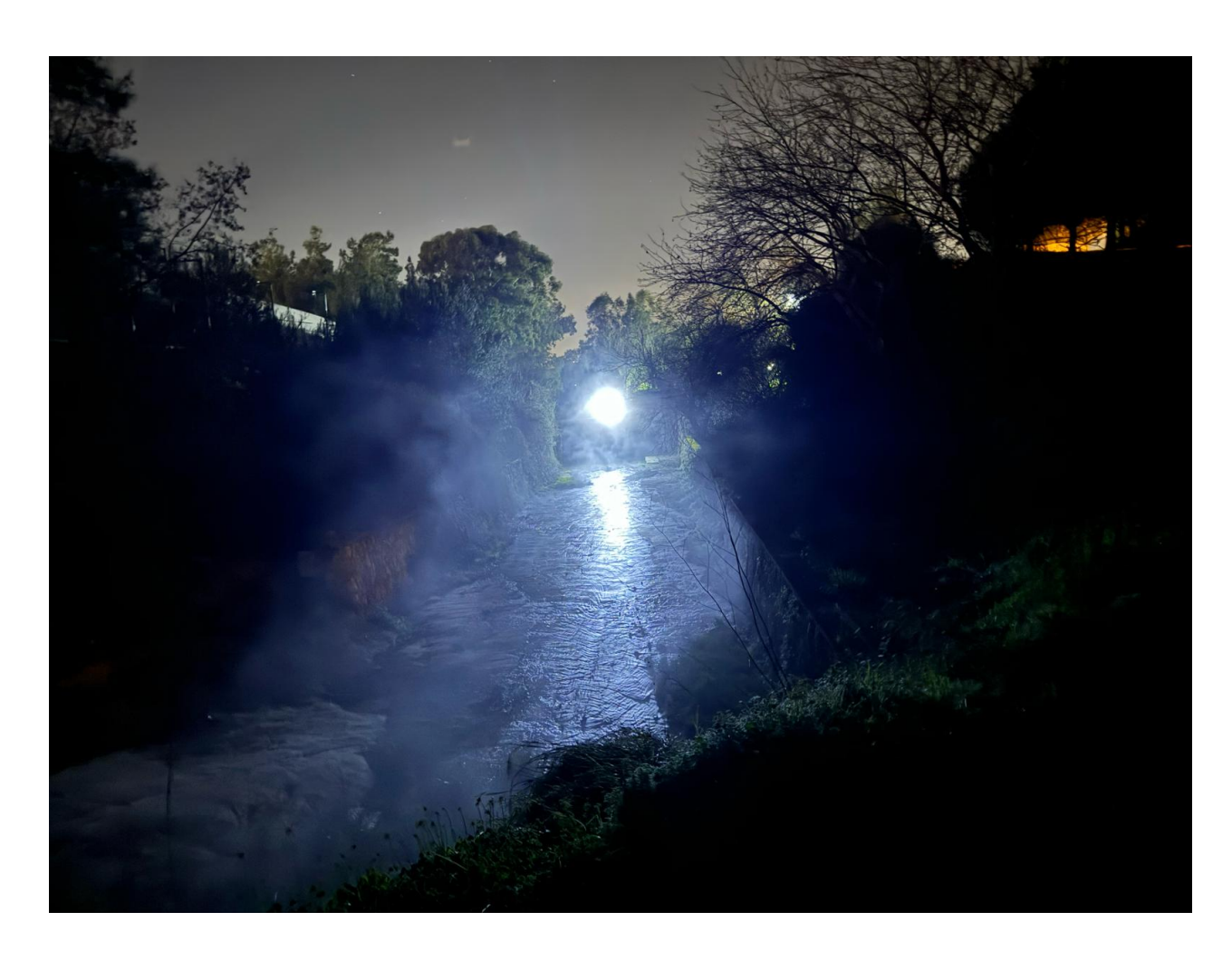
UFO 002: "Ocularid"

10 February 2024 (01:13, GMT+03). Balcova, Izmir. Captured with an iPhone. Please note the vapor rising out of the stream despite the cold weather, localized in the vicinity (that is to say, not ordinary mist).