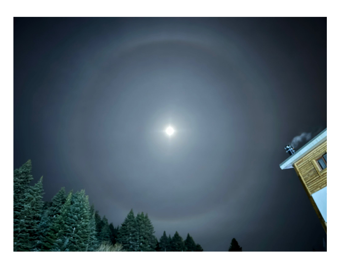
UFO 003: "Vimana"

26 February 2024 (04:31, GMT+03). Uludag, Bursa. Captured with an iPhone. Note the exceptional brightness at 4:31 am.